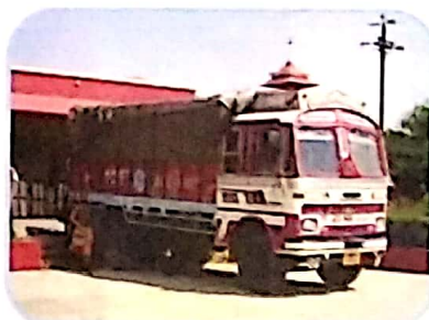
8 Truck L