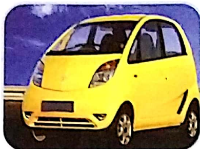
2 Car L