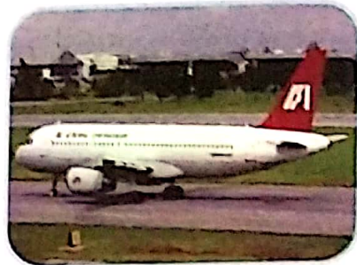
3 Aeroplane A