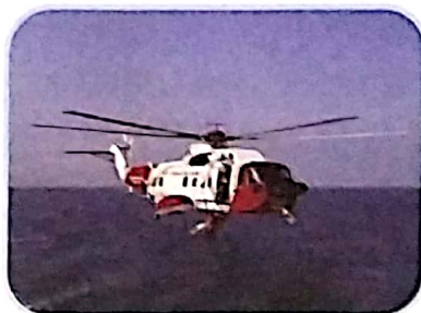
5 Helicopter A