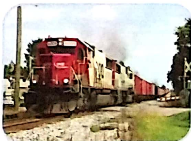
18 7 Train L