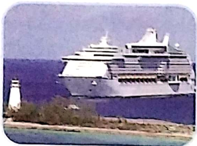
1 Ship W

Here are some of the pictures of different forms of transport. Recognize and write A for Air Transport, L for Land Transport and W for Water Transport in the given boxes.