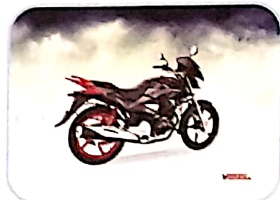
6 Motorcycle L