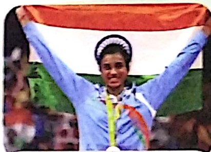
8. P.V. Sindhu Badminton