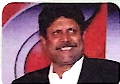
4. Kapil Dev Cricket