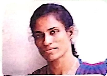
5. P.T. Usha Athletics