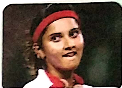
2. Sania Mirza Tennis