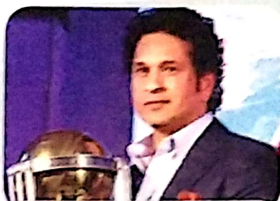
1. Sachin Tendulkar Cricket

Who is your favourite sports star? Do you like Sachin Tendulkar and Ishant Sharma? Have you ever heard of Sania Mirza? Can you identify the following sports personalities and name the game associated with them? One has been done for you.