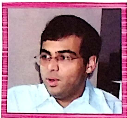
1. Viswanathan Anand CHESS

Here are the pictures of some famous sports people. Recognize and write their names.