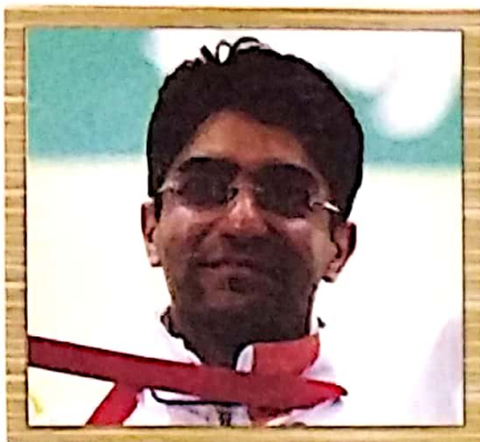
4. Abhinav Bindra SHOOTING