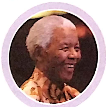
5. Nelson Mandela