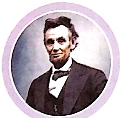
1. Abraham Lincoln

Here are the pictures of some famous people from around the world. Recognize and write their names.