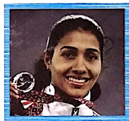
6. Anju Bobby George ATHLETICS (LONG JUMP)