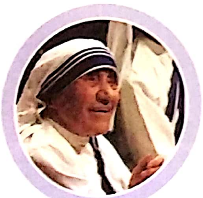
4. Mother Teresa