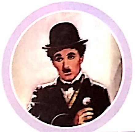
6. Charlie Chaplin