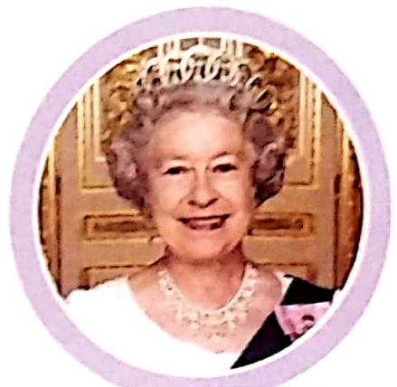
3. Queen Elizabeth