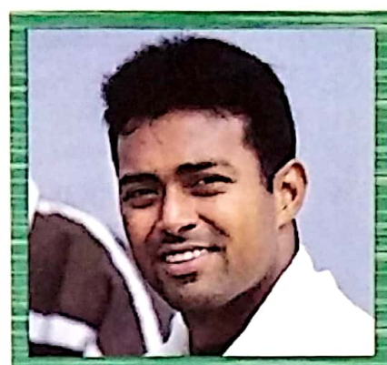
3. Leander Paes. TENNIS