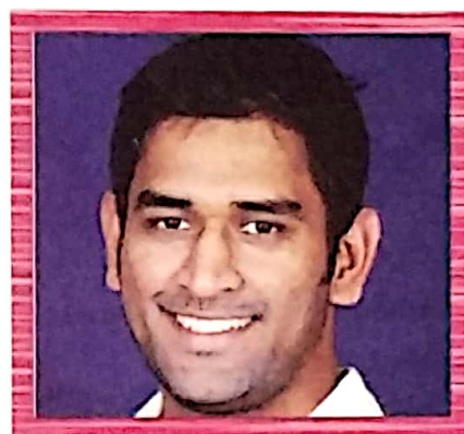
5. Mahendra Singh Dhoni CRICKET