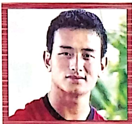
2. Baichung Bhutia FOOTBALL