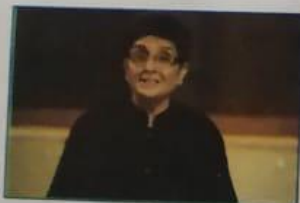
First woman IPS Officer