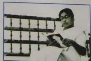
First woman Chief Minister of a state (UP)