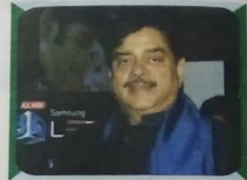
3. Shatrughan Sinha