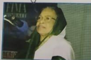
First woman Judge of Supreme Court