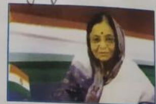
First woman President of India