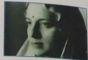
First woman President of UN General Assembly