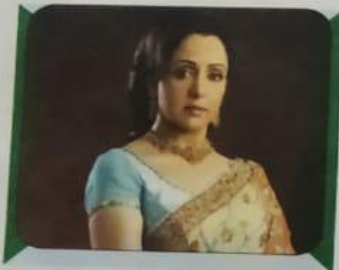
7. Hema Malini