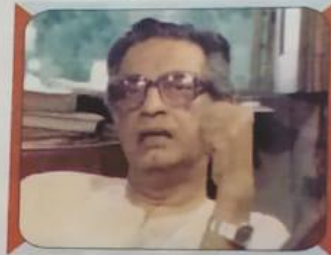
5. Satyajit Ray