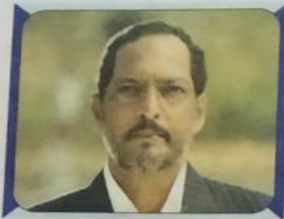
1. Nana Patekar

Given below are some of the famous personalities associated with cinema in different languages. Identify them and write their names below each picture.