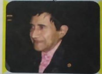
6. Dev Anand