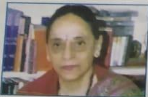
First woman Chief Justice of High Court