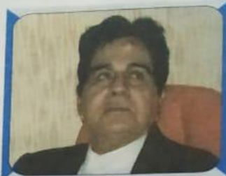
2. Dilip kumar