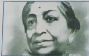
First woman Governor of India