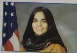
First woman to go in to Space