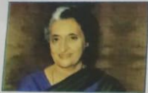
First woman Prime Minister of India

Here are the pictures of some great Indian women personalities. Recognise them and write their names below each picture: