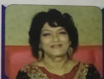
9. Saroj Khan