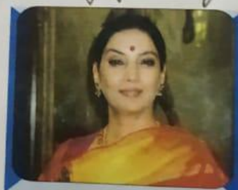
8. Shabana Azmi