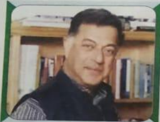
4. Girish karnad